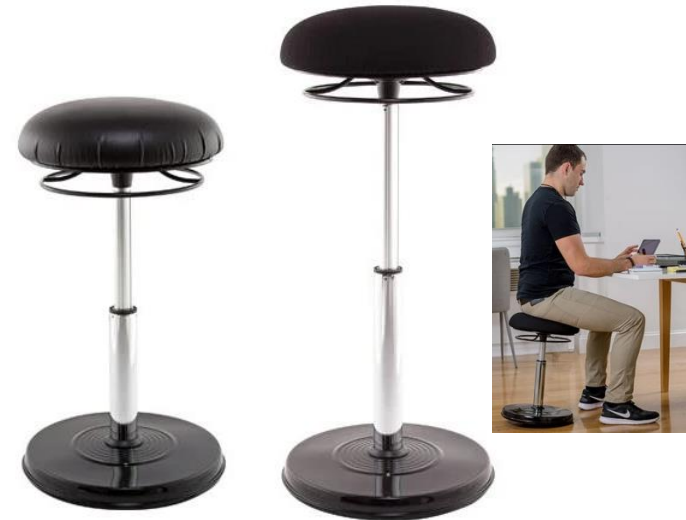
Product Images: KOR1524